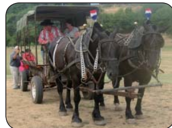
Horse & Wagon Rides