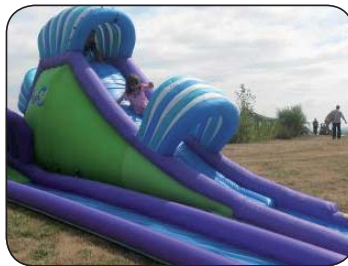
Kids Games & Puppet Show Water Slides • Bouncy House Game Booths — ALL FREE