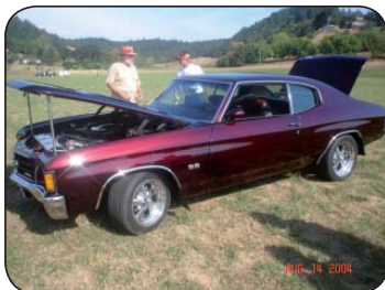
McMinnville Auto Club