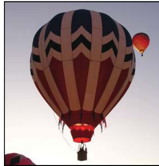
Fly-out at Daybreak