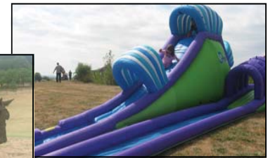
Horse and wagon rides

11am&1pm Second Wind Band 3 pm: Mike Fite 4 pm: Old Time Fiddlers 6 pm: Knox Bros